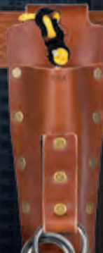
TOOL HOLDER TENSION STRAPS 5890