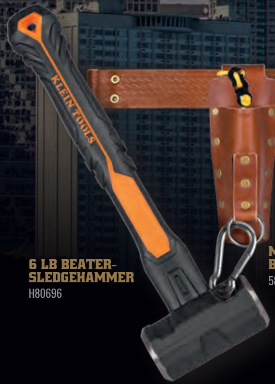
6 LB BEATER-SLEDGEHAMMER H80696