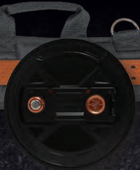
QUICK-LOCK TIE WIRE REEL 27500