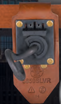
ADJUSTABLE CONNECTING BAR HOLDER 5859SLVR