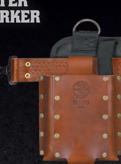
THREE POCKET LEATHER TOOL HOLDER 5818P3