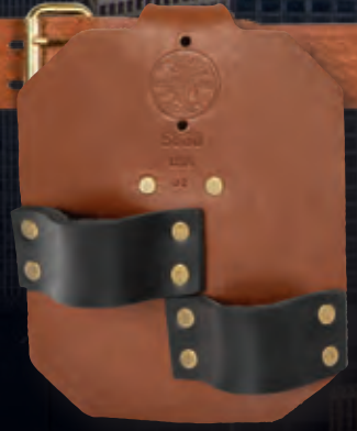
HEAVY-DUTY SPUD WRENCH HOLDER 5860