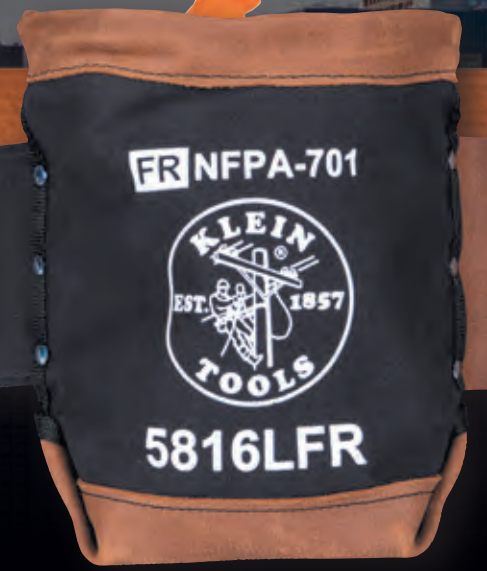
HYBRID LEATHER AND FLAME-RESISTANT CANVAS BOLT BAG 5816LFR