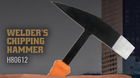
WELDER'S CHIPPING HAMMER H80612