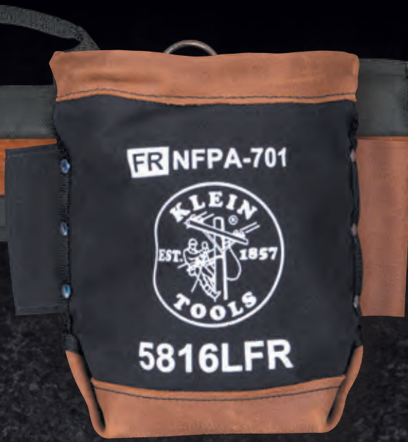
HYBRID LEATHER AND FLAME-RESISTANT CANVAS BOLT BAG 5816LFR